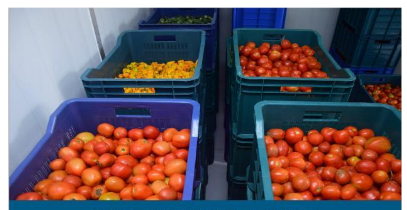
Extends the shelf life of perishable food from 2 days to 21.