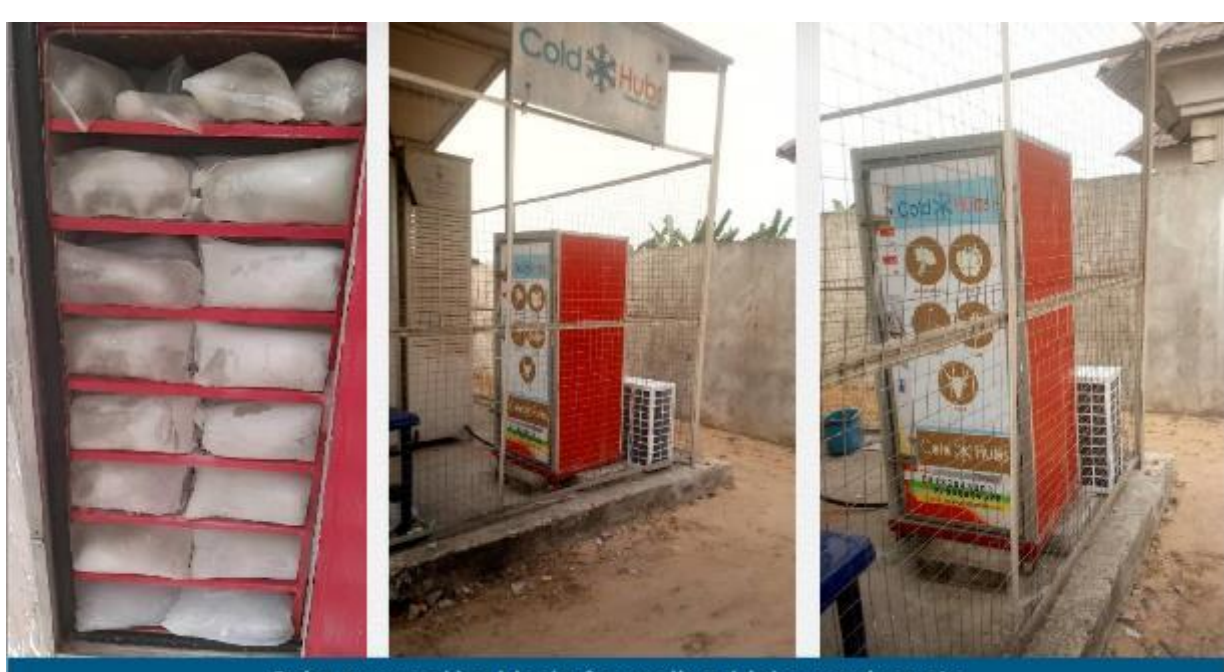
Solar powered ice blocks for cooling drinks; vaccines etc