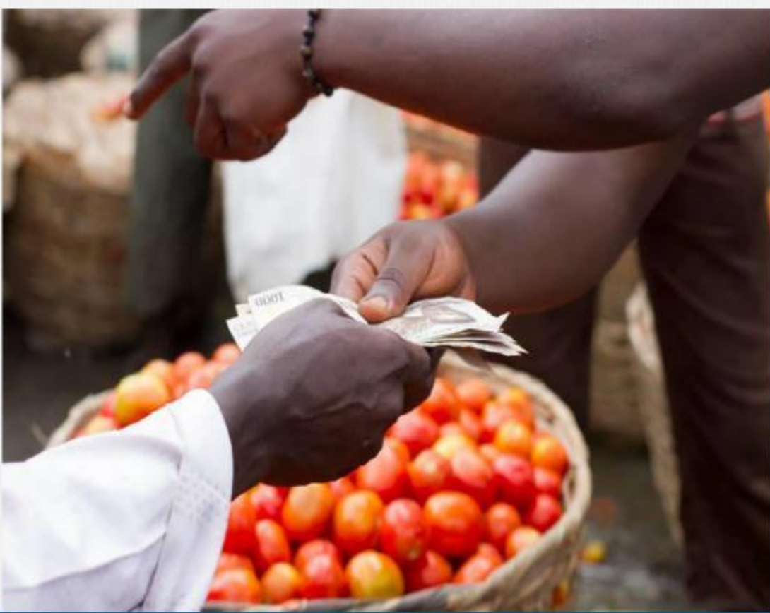
...this causes 93 million small farmers to lose 25% of their annual income.

Source: Rockefeller Foundation; Food Waste and Spoilage Initiative 2014