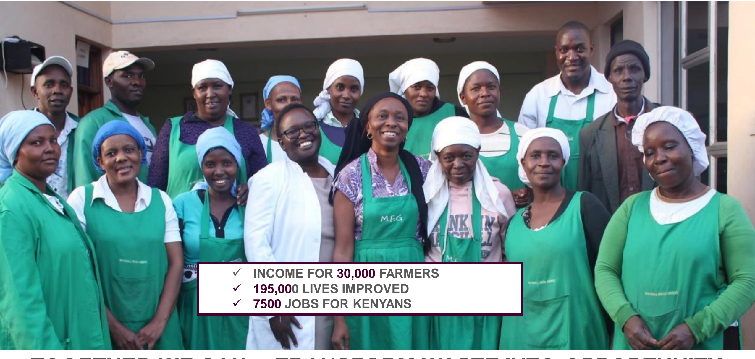
TOGETHER WE CAN ...TRANSFORM WASTE INTO OPPORTUNITY