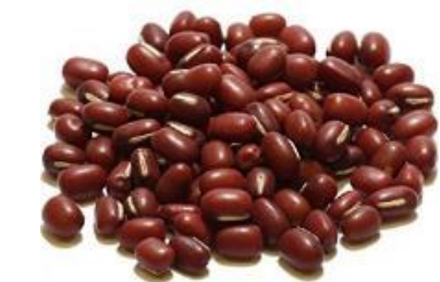
Iron 75.17 - 85.35ppm