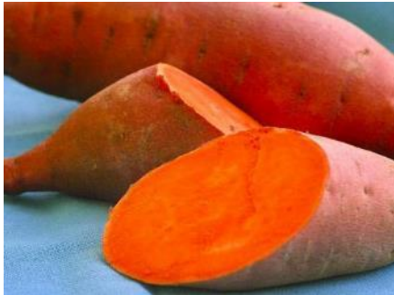
Beta Carotene 30 - 100ppm