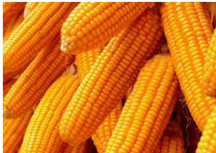
Beta Carotene 8 - 15ppm