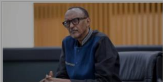
Rwandan President Paul Kagame