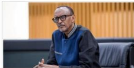
Rwandan President Paul Kagame