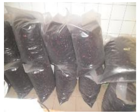
Organic, fair trade and HACCP dried mango