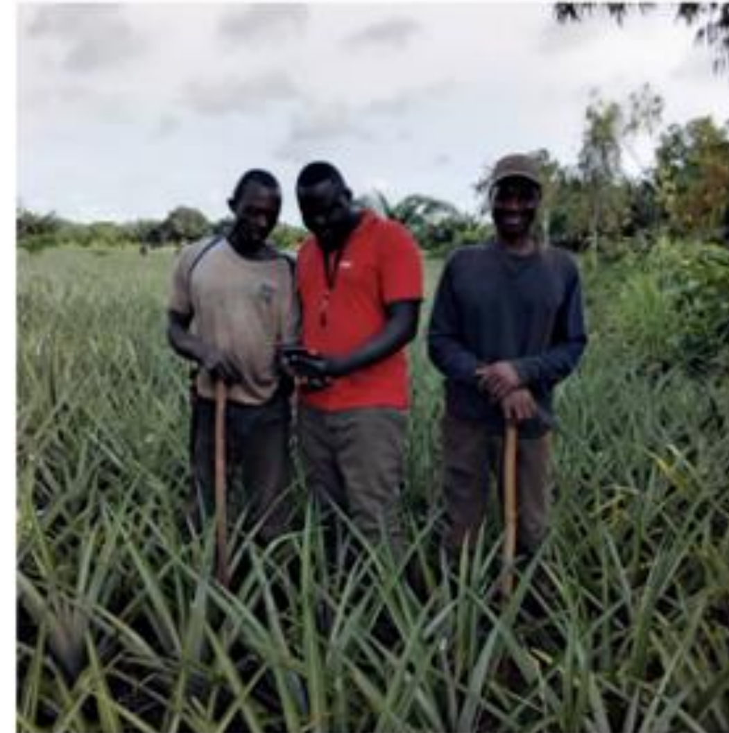
Training and registration of fields in Tori