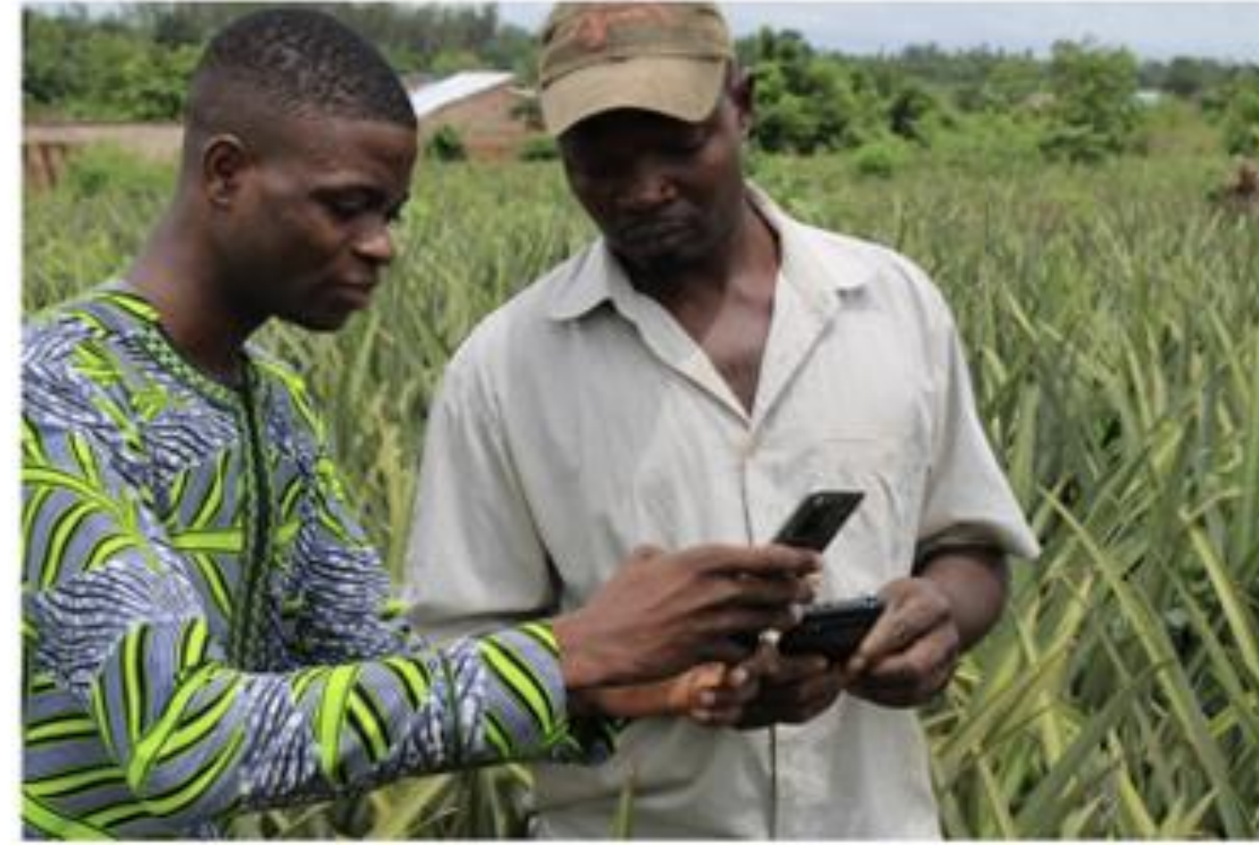
Training and field registration at Zè Tango