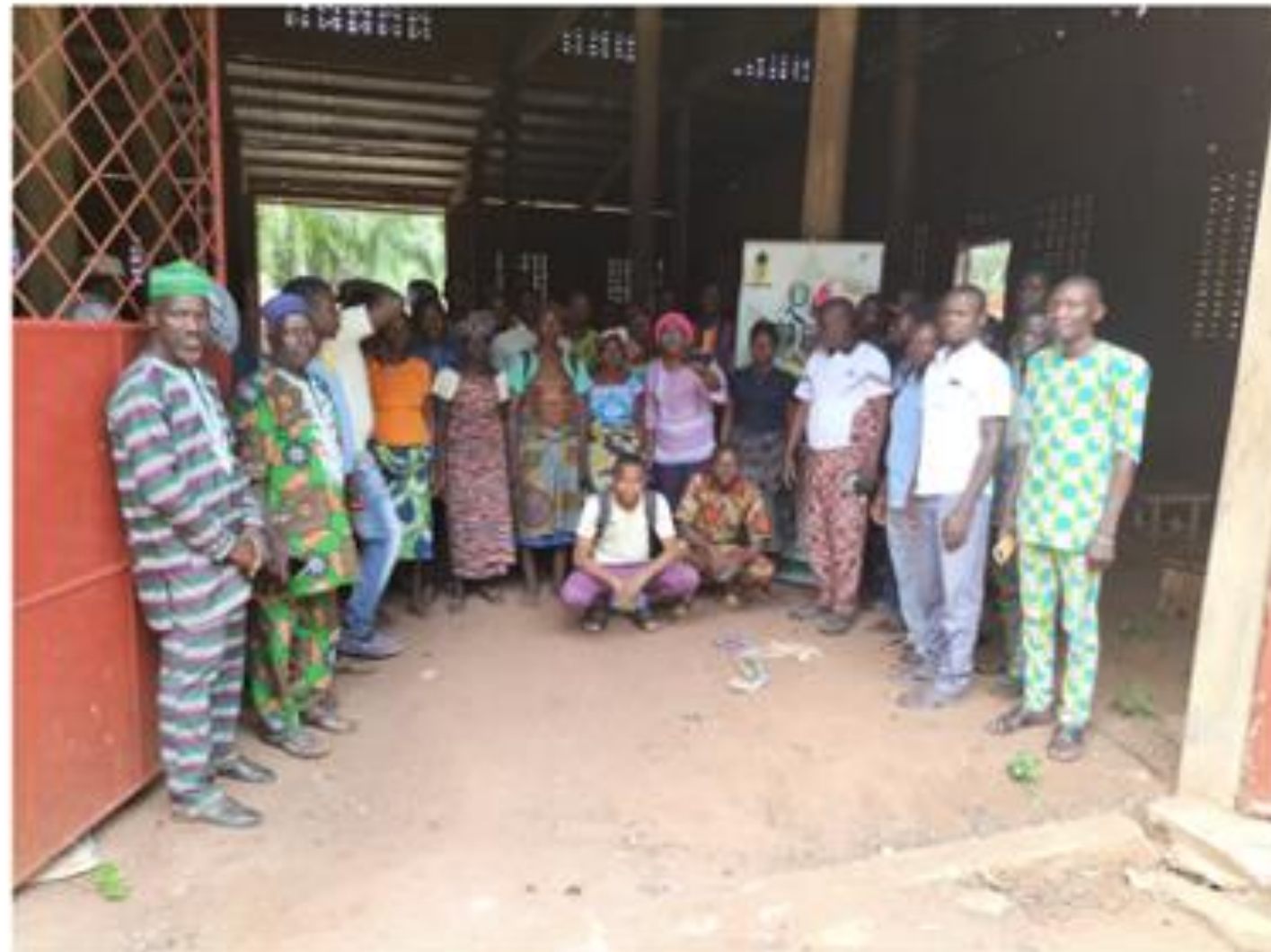
Sensitization of producers in Zè Aifa