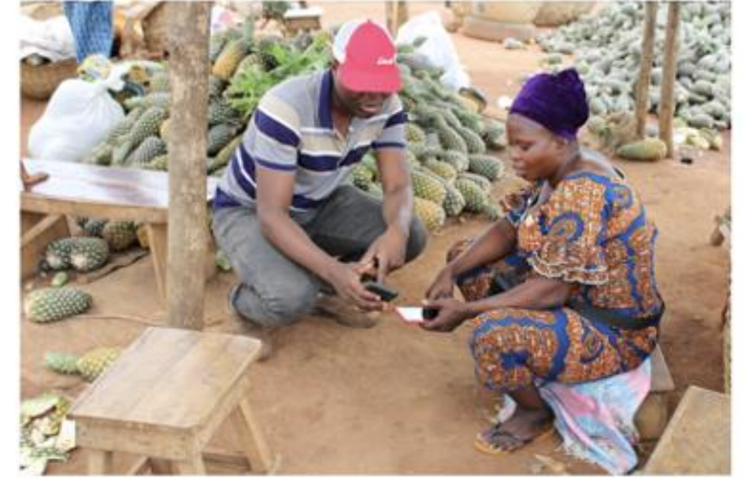
Meeting the merchants