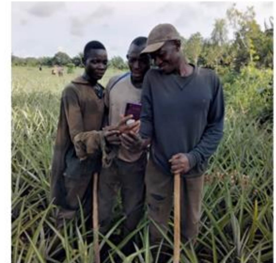
To the mastery of e-pineA by Tori producers