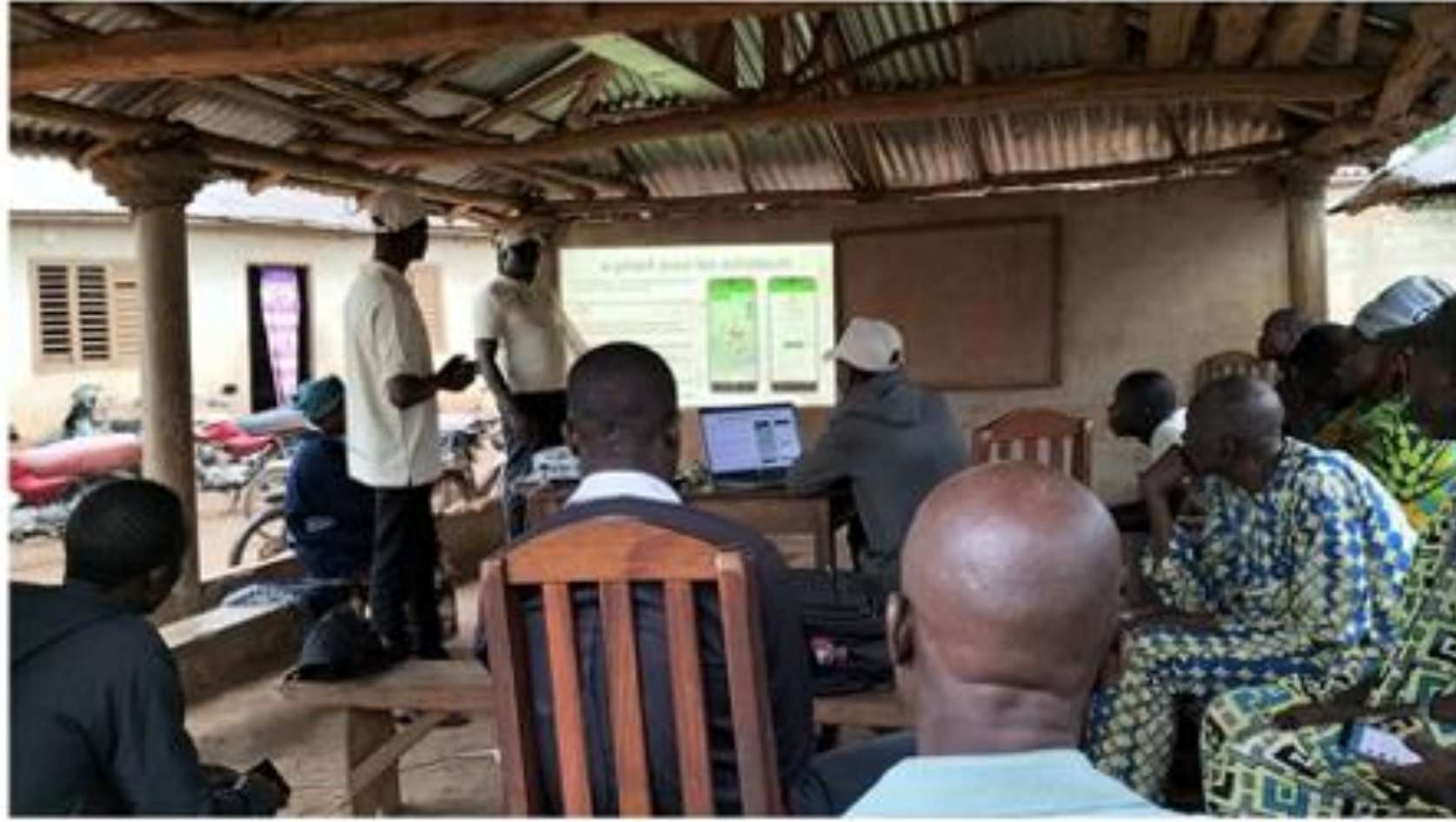
Sensitization of the actors in Zè center