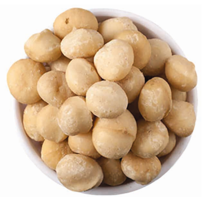
Processed macadamia kernels