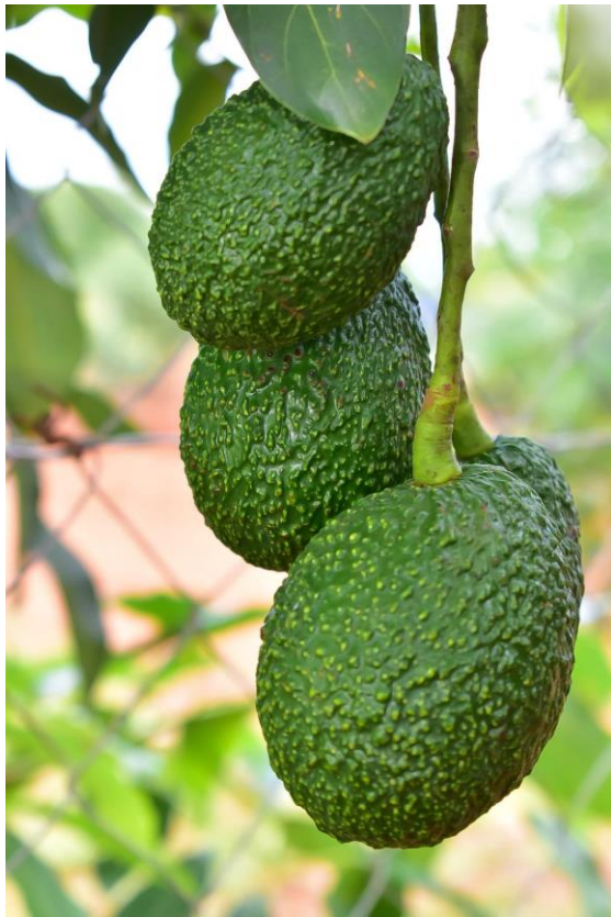
Fresh fruit at the farm