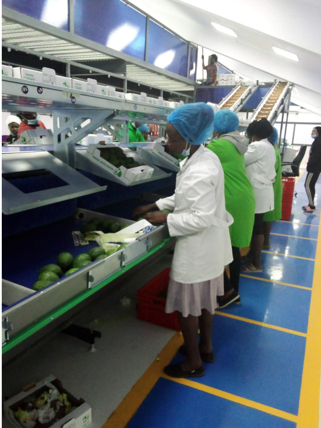
Sorting and Grading