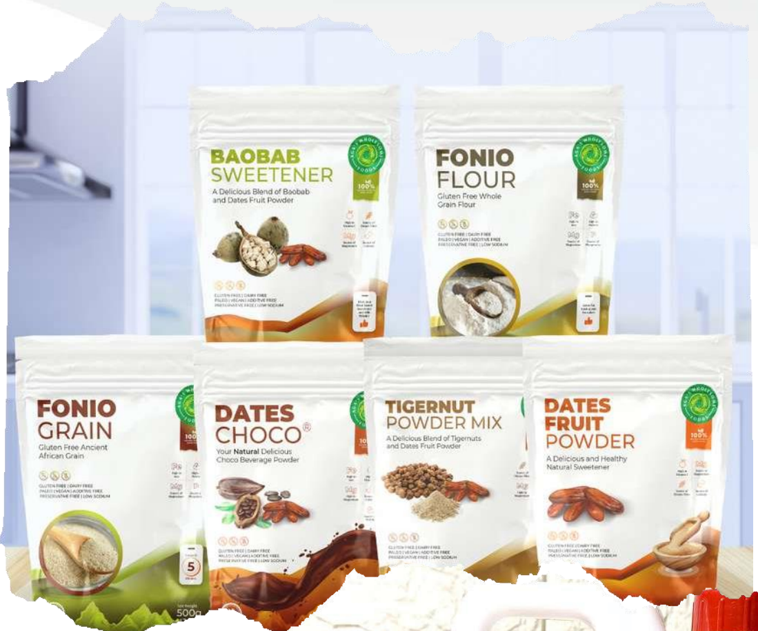
Plant based, gluten & dairy free beverage powders