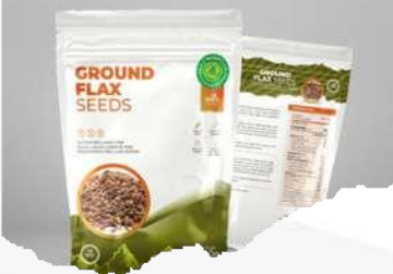
Natural immune boosters