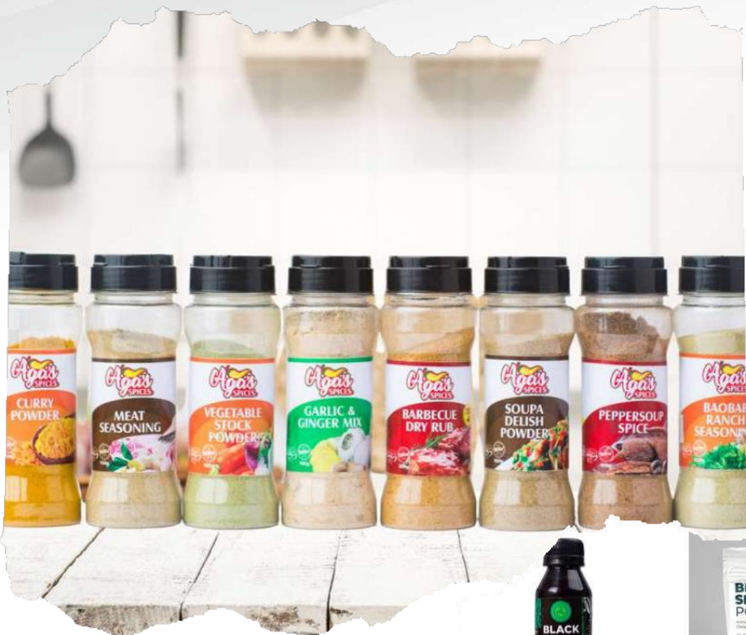
Low sodium & MSG free seasoning powder