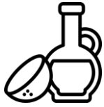
Cold Pressed Virgin Coconut Oil