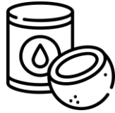
Coconut Milk & Cream