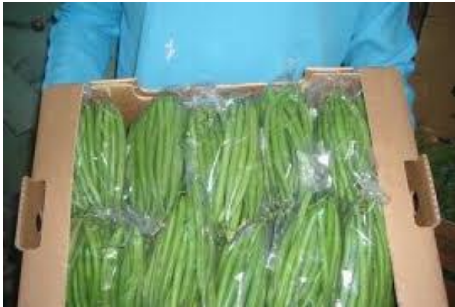
Green beans in perforated bags